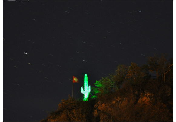
Mega Cactus/Switzerland - 9 m